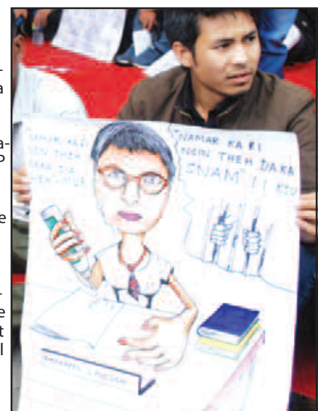
A member of pro-ILP pressure groups holds a placard depicting Urban Affairs minister Ampareen Lyngdoh during sitin-demo on Wednesday.