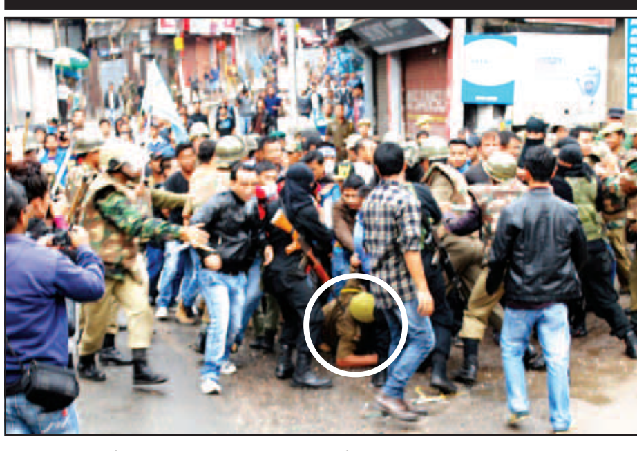
A policeman falls on the ground (encircled) after being heckled by aggressive pro-ILP activists on the GS Road in city on Wednesday. (ST)

No untoward incident ernment failed to respond to groups. was reported from any part their twin demands-- (A) re-Earlier in the day, the 13 iel Khyriem and (B) drop- of the activists of the pres- next few days if the Governro-II P pressure groups ping of all the cases filed in sure groups.